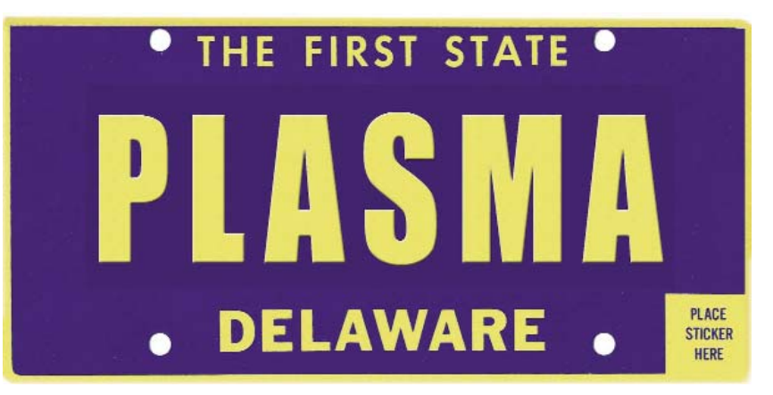
Most people seem to think that the words at the top of this license plate refer to the state of Delaware. Now you know the real story.

Thus plasma deserves respect both as an ancestor and as a major player in our world. Clearly the usual sequence of states of matter should be reversed, with plasma not merely added to that list, but put first to lead that list.